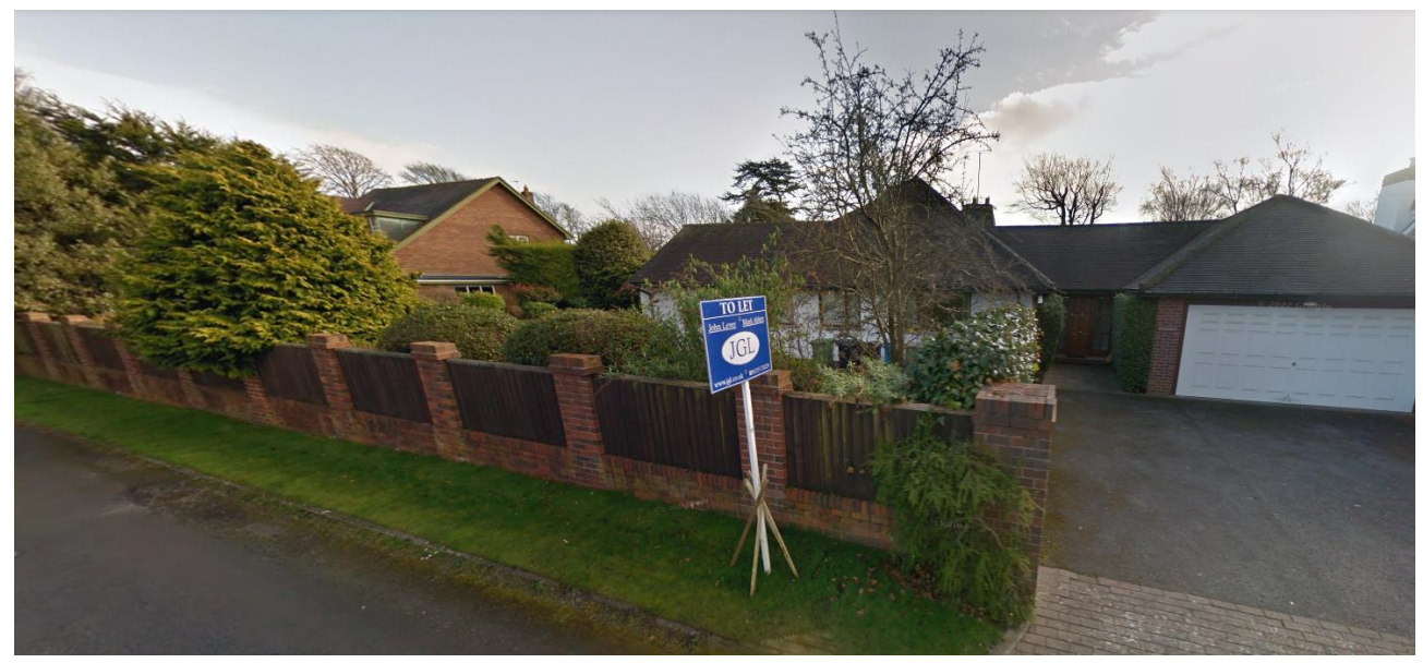
Figure 2 - StreetView Extract of Pennard from Islay Road (Dated March, 2017)

An additional StreetView image, dated March 2017 is shown by Figure 2 below. As illustrated, the existing trees at the boundary with Islay Road (north) were removed to facilitate the replacement dwelling, with replacement planting undertaken at the site; thus, illustrating the acceptability of such.