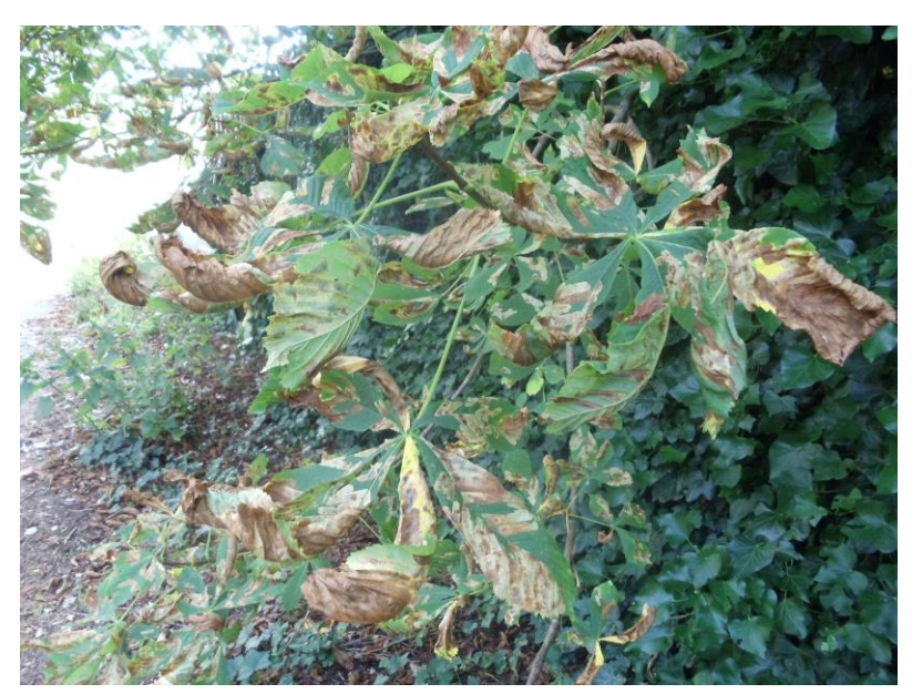
Figure 4 - T24 Displaying Evidence of Disease

Nevertheless, the applicants strongly object to the TPO for G2, with the proposals currently illustrating that all of these trees are to be removed to facilitate the proposed redevelopment of the site. In terms of the trees which comprise G2, T24 is diseased (shown below by Figure 4) which reduces its public visual amenity value. T25 has a large open cavity at the base which renders it potentially unsafe. T41, T42 and T43 do not warrant TPO status. T45 and T46 both show evidence of branch failures and deadwood, while T44 and T47 show evidence of deadwood and as such, all four could be potentially dangerous. The proximity of a number of the existing trees to the existing property could also pose a risk in terms of hazards.