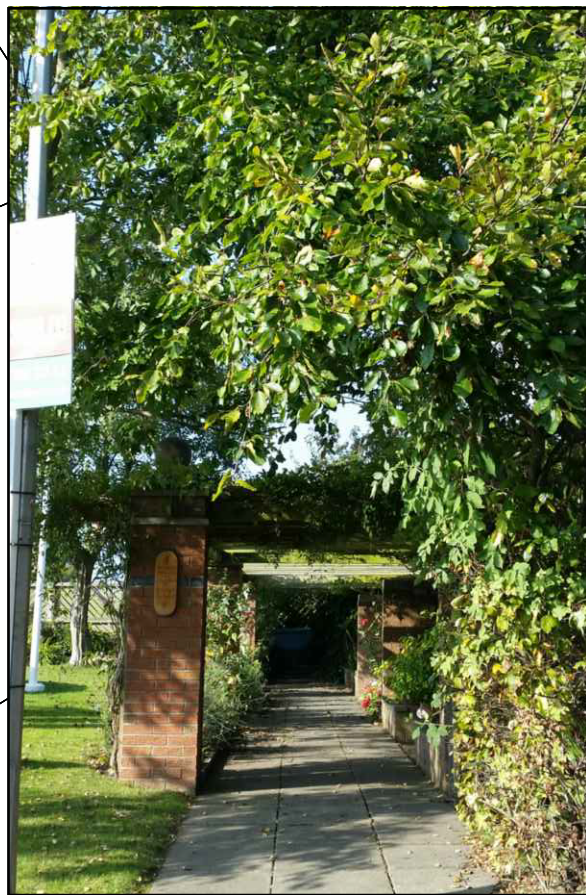
Memorial Garden / Pergola Walkway