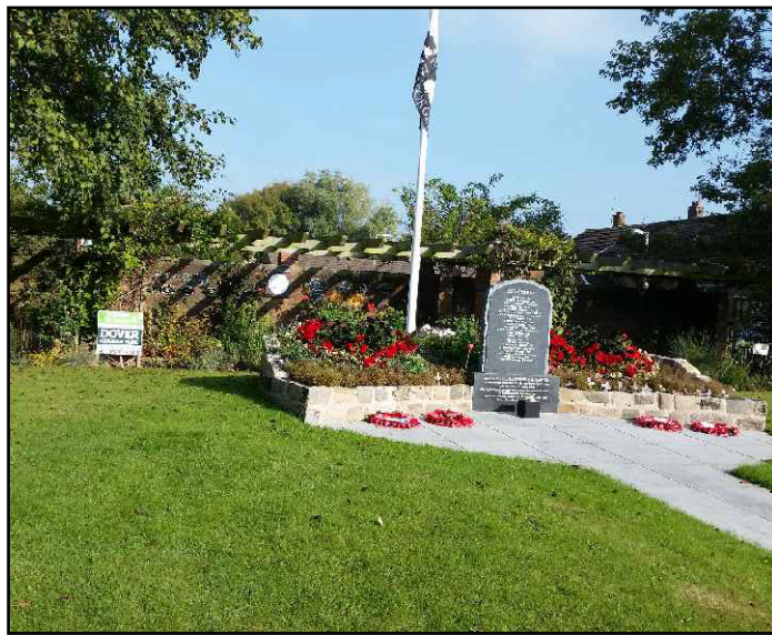
The existing Memorial Garden