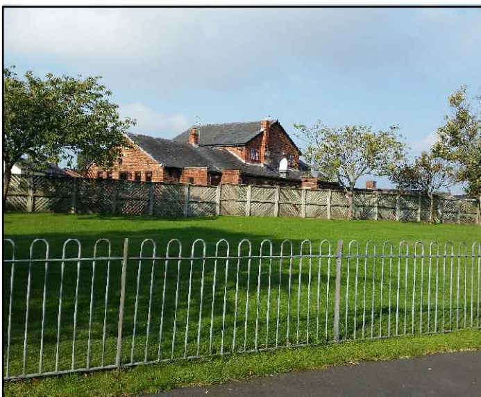
The Public Open Space and Play Ground