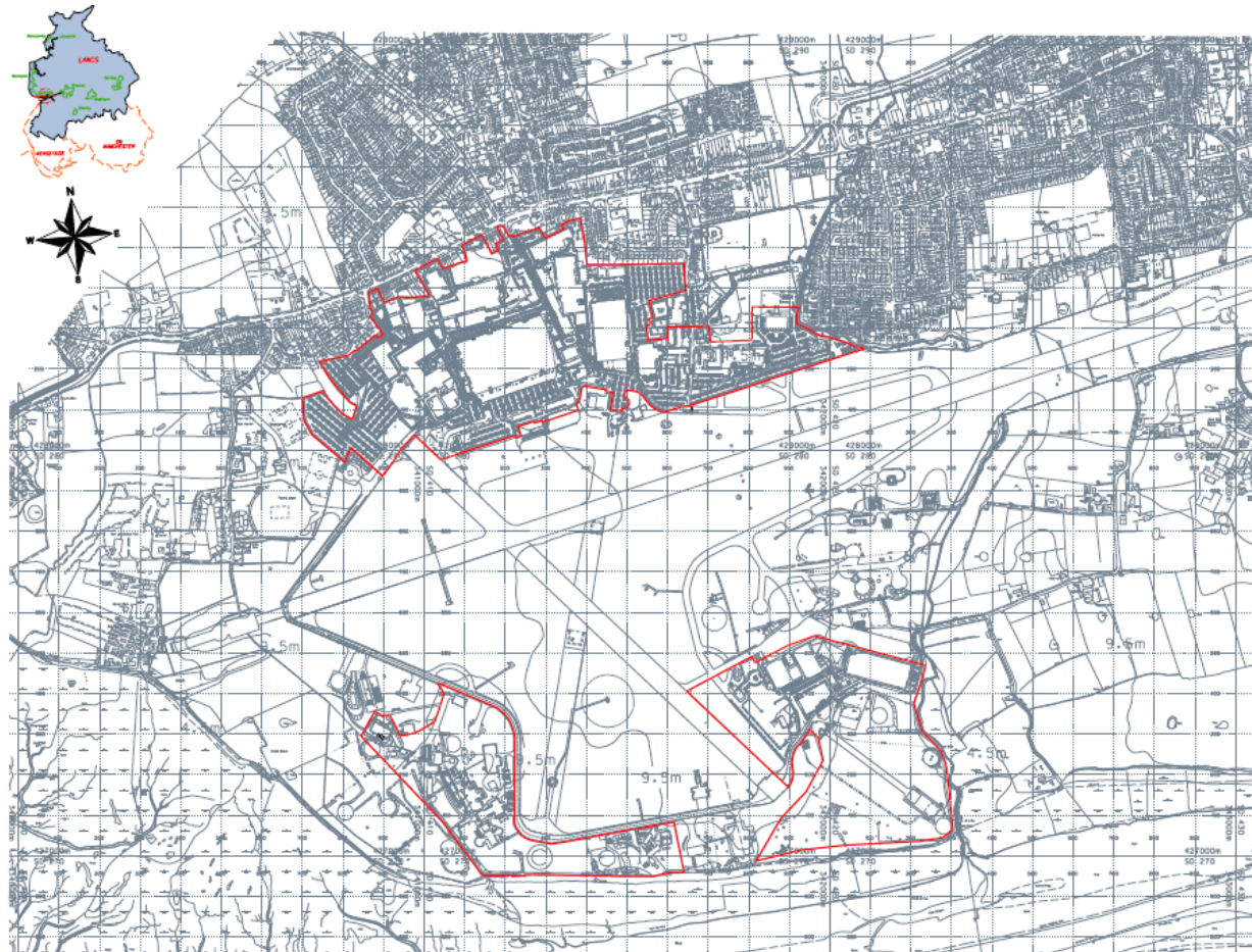
Figure 2 – Map of Lancashire Enterprise Zone (Warton)