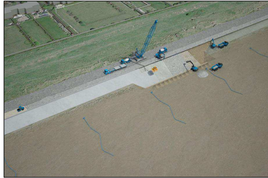
Filling and Lifting Operations at Church Scar