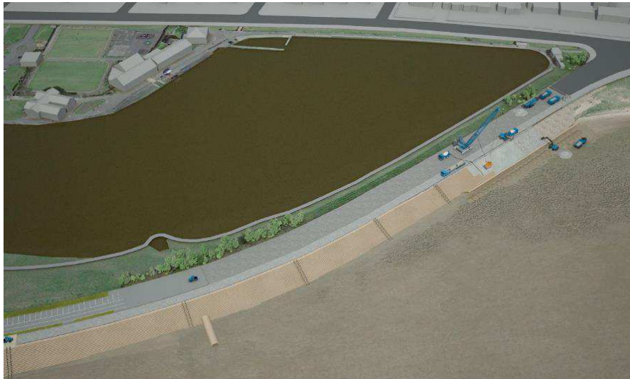
Filling and Lifting Operations at Fairhaven