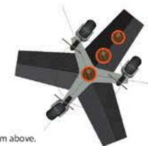
Mobile Gondola from above.

Everything we build should consider habitat improvement as integral. Native wildflowers grasses and edibles. Anything from turf roofs and walls to bug hotel benches and grasscrete style pavements