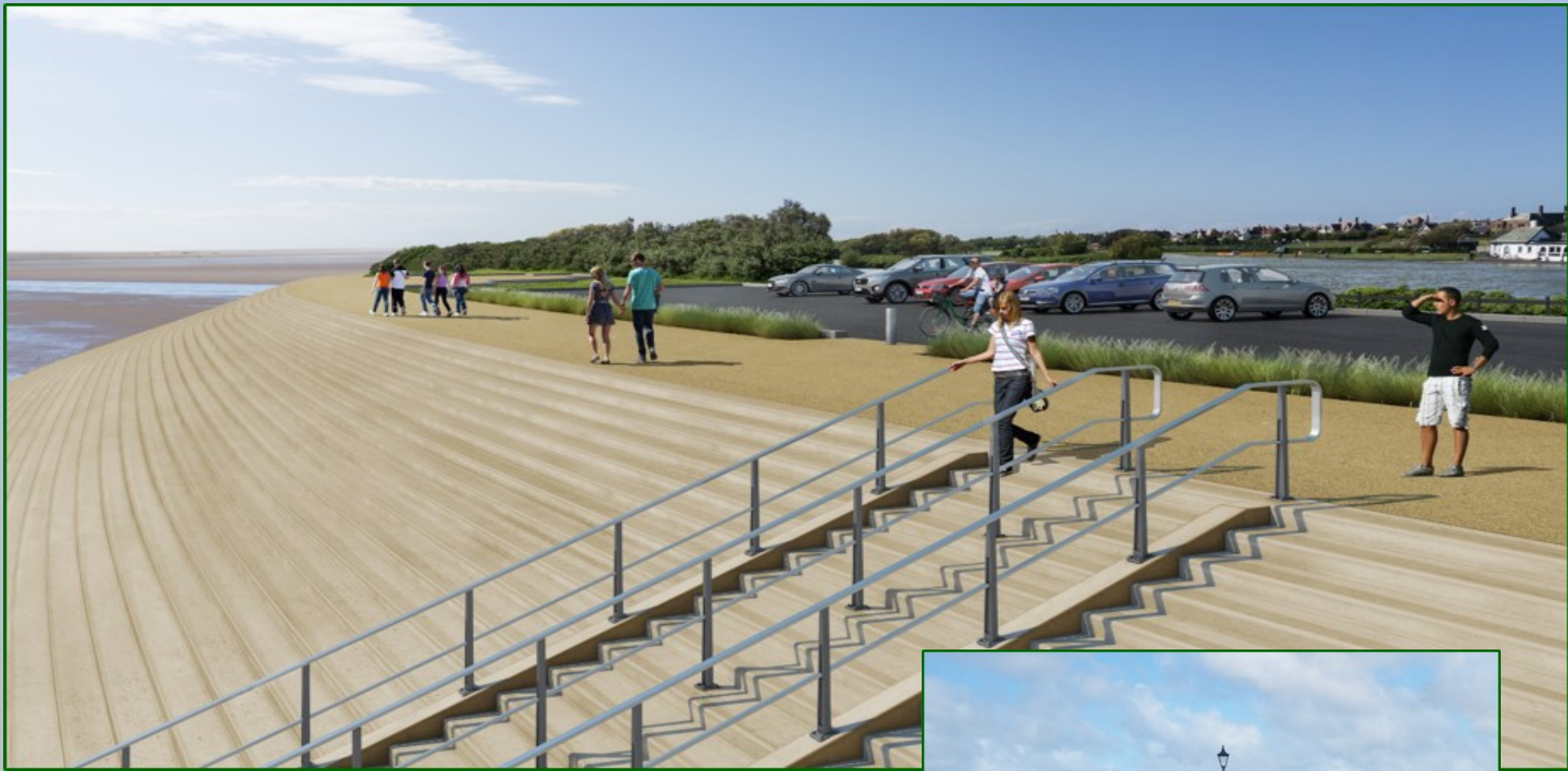
Fairhaven & Church Scar